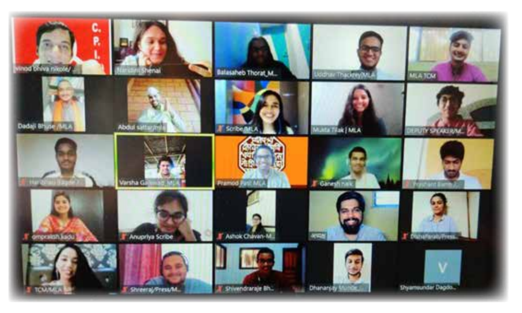
Group Photograph of the participants in the Maharashtra Legislative Assembly – one of the five mock committees simulated at PCGT NYP 2020

to understand the legislative process and functioning of the Parliament well as as to analyze further and research upon the issues that are current and relevant from a socio-legal perspective.