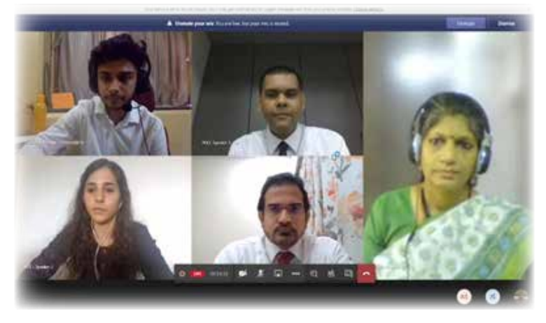
Webinar on Ethics and Professional Standards in a Modern Law Firm (August 30, 2020)