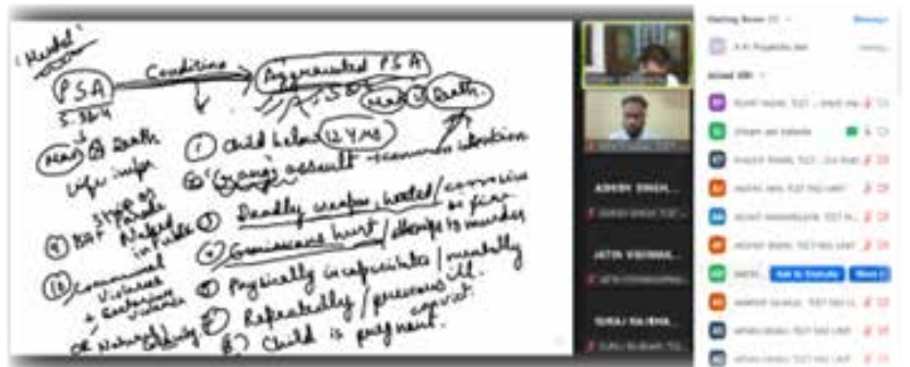
POCSO Webinar on 9th April 2022