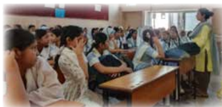
Session at Anjuman Islam School, Bandra

A Two days session on Acceptance & Appreciation was held with 131 students of Anjuman Islam Dr. Mohammed Ishaq Jamkhanwala Girls High School.