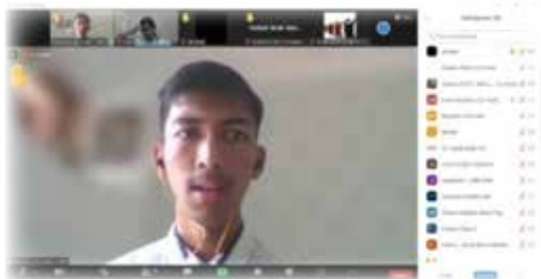
Model UN Day 1