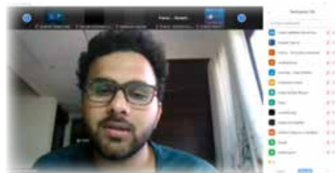
Model UN Day 2