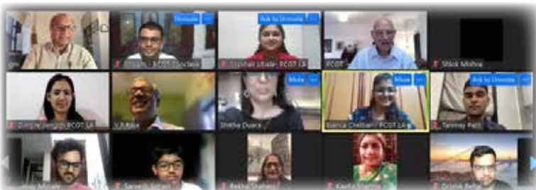
Closing Ceremony Group Photograph with the Chief Guest (First Row extreme left)