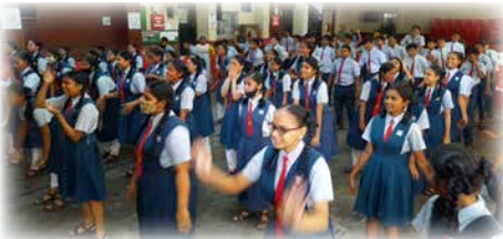
Session at Purshottam High School

People learn most of their values in the early years of their life from those they see around them. Children absorb these values from their parents and teachers. Families and educators play a crucial role in building values in children and students as they see them as role models. PCGT's Kuchh Aur programme held sessions on different values in schools and communities.