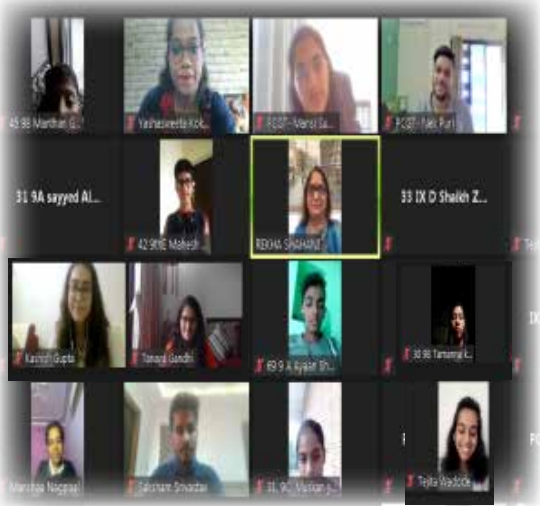
Session with Std. IX, Purushottam High School