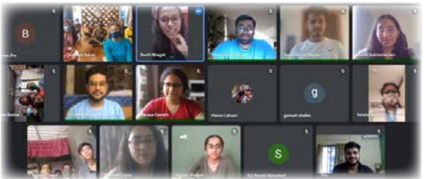
Session with Interns