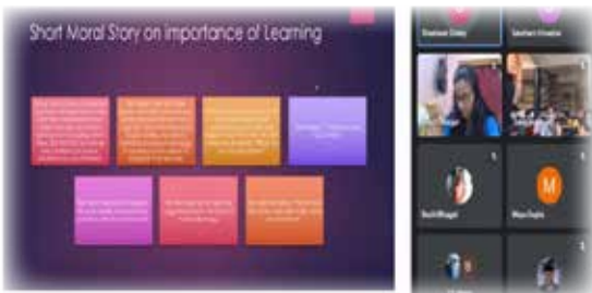
Short Moral Story on Importance of Learning