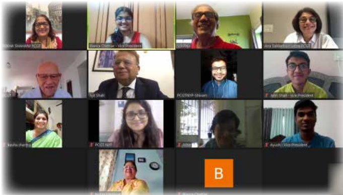
Group Photograph with the Chief Guest of NYP 2021