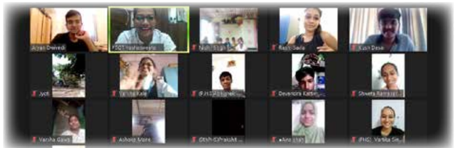
Session held with Nerul Community students in April 2021