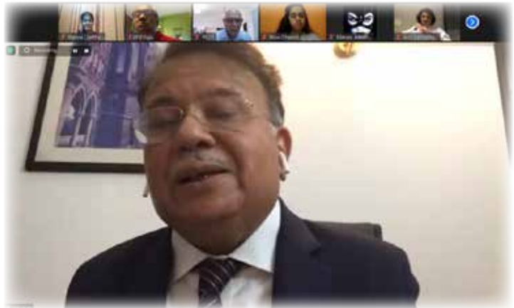
Hon'ble Mr. Justice (Retd.) A. P. Shah addressing the audience at the Virtual Closing Ceremony of NYP 2021

The third edition of the National Youth Parliament (NYP) was organized by PCGT in association with Pravin Gandhi College of Law, Mumbai (PGCL) on April 10 and 11, 2021. In view of the COVID-19 pandemic and social distancing norms, the NYP was conducted virtually on Zoom.