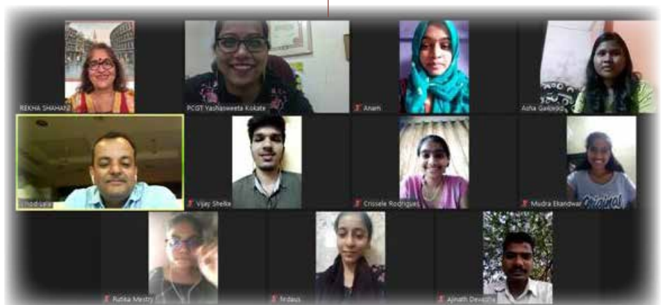
Students of Nirmala Niketan of BSW & MSW in collaboration with LIFE Foundation