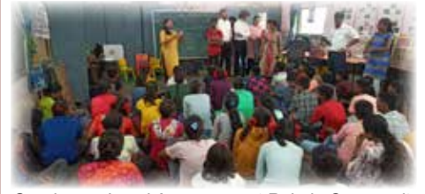
Session on Legal Awareness at Rabale Community

Teaming up for a greater impact, PCGT partnered with the Pro Bono Club of Maharashtra National Law University, Mumbai. In Mankhurd & Rabale communities and Anjuman-I-Islam's (Dr. MIJ Girl's High School), sessions were conducted about the Introduction of Legal Awareness, POCSO Act, and Good Touch, Bad Touch. Valuable insights into the Protection of Children from Sexual Offences (POCSO) Act were shared, aiming to spread awareness and foster a safer environment for our children.