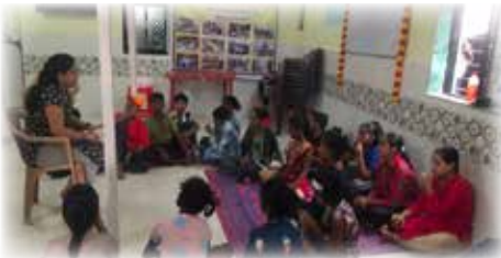
Celebration of World Animal Day at Chikuwadi Center, Mankhurd

In the vibrant months of October to December 2023, we focused on instilling essential values in schools and communities. Events included a lively 'Gandhi Jayanti Celebration' at Purushottam High School, where students explored Gandhi's legacy and principles through dynamic discussions and engaging activities to empower them with virtues for navigating life with grace and integrity.