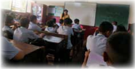
Celebration of Gandhi Jayanti at Purushottam High School

In the vibrant months of October to December 2023, we focused on instilling essential values in schools and communities. Events included a lively 'Gandhi Jayanti Celebration' at Purushottam High School, where students explored Gandhi's legacy and principles through dynamic discussions and engaging activities to empower them with virtues for navigating life with grace and integrity.