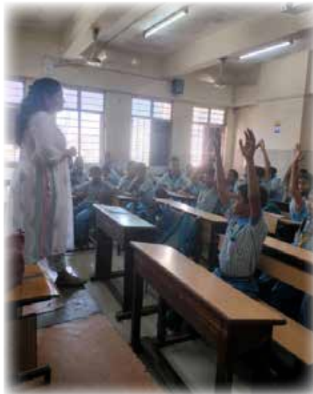
Session on Kindness at Sardar Vallabhbhai Patel Vividhlaxi Vidhyalaya

A transformative experience unfolded as students immersed themselves in a session centered around the theme of 'Kindness' at Sardar Vallabhbhai Patel Vividhlaxi Vidhyalaya, delving into its profound significance and far-reaching impact in our lives. The session sparked a lively conversation, unraveling the incredible potential woven into three magical words — Thank You, Sorry, and Please — capable of elevating our daily interactions. Adding a touch of sincerity, students crafted heartfelt thank-you letters, extending gratitude to parents, friends, cousins, and anyone deserving of acknowledgment, creating a ripple of positive energy within the session.