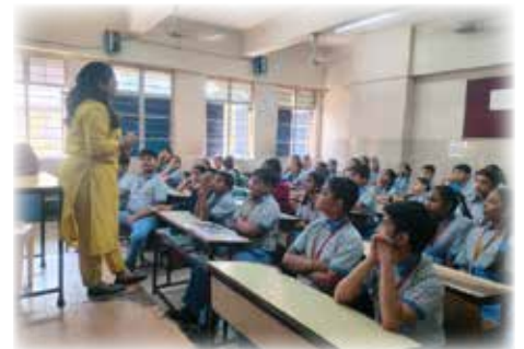
Session on Unity at Rabale Community & Sardar Vallabhbhai Patel Vividhlaxi Vidhyalaya

An engaging session on 'Unity' was conducted at Sai Nagar Center and Sambhaji Nagar Center of the Rabale community and Sardar Vallabhbhai Patel Vividhlaxi Vidhyalaya. During the session, the importance of unity was discussed, a relevant story was shared, and a game of 'Noughts and Crosses' with two teams was organized. Through this interactive game, the value of unity was exemplified. The game's moral conveyed that if both teams collaborated instead of competing, they could have collectively achieved three winning lines each. Following this, students were encouraged to share their opinions, enriching their understanding of the significance of unity, thereby enhancing their overall learning experience.