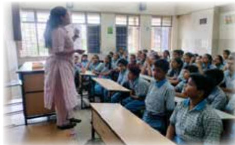
Session on Gender Equality at Sardar Vallabhbhai Patel Vividhlaxi Vidhyalaya

A session on Gender Equality was conducted at the Rabale community and Sardar Vallabhbhai Patel Vividhlaxi Vidhyalaya. The students were queried about their understanding of gender equality and what it meant to them. Following this, four short clips related to the topic were showcased, initiating a discussion. The students exhibited a positive response, posing various questions and articulating the view that boys and girls are equal and capable of undertaking any task. The session underscored the importance of fostering a mindset that promotes equality, encouraging students to challenge societal norms and embrace a more inclusive perspective. The interactive nature of the session not only gauged their comprehension but also contributed to fostering a culture of open dialogue and understanding regarding gender equality.