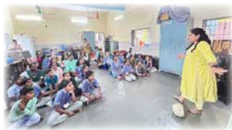
Session on Peace with students of Std. X and Std. VI & VII at Rabale Community