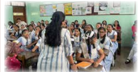
Session on Respect & Discipline at Anjuman-I-Islam's (Dr. MIJ Girl's High School)

and acknowledgment, linked discipline to good habits for goal achievement, and highlighted positive outcomes in Homework and Responsibility discussions. The GAINS Approach guided goal setting, and a group activity focused on Interests and Networking. The session concluded with Reflection and Journaling, stressing self-reflection for growth and discipline maintenance. The takeaway: encourage girls to apply respect and discipline for holistic personal development.