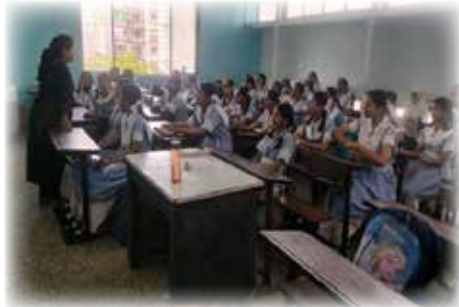
The Art of Active Listening Anjuman-I-Islam's (Dr. MIJ Girl's High School)

proWess. A lively group activity ensued, where students shared their partner's hobbies, presenting them to the collective. Wrapping up, positive feedback regarding the session was graciously offered by the students, completing this engaging exploration of the art of active listening.