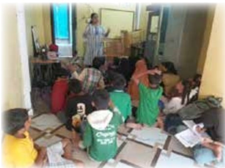
The Art of Active Listening Mankhurd Community

Conducted a vibrant 'Unity' session at Sai Nagar and Sambhaji Nagar centers. Discussed unity's importance, shared a relevant story, and organized a 'Noughts and Crosses' game. The interactive game showcased the value of collaboration over competition. Students shared opinions, enriching their understanding of unity's significance. Enhanced overall learning experience at Rabale community and Sardar Vallabhbhai Patel Vividhlaxi Vidhyalaya.