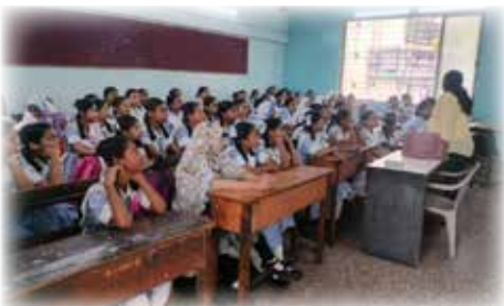
Unity in Diversity at Anjuman-I-Islam's (Dr. MIJ Girl's High School)

At Chikuwadi Center, Mankhurd, students gathered for 'World Animal Day' celebration. Introduced PCGT's "Kuchh Aur" programme and explored the global theme "Great or Small, Love Them All." Activities like "Guess the Animal using Riddles," fostered empathy and highlighted our shared responsibility toward animals. Lesson : Every being deserves care and protection, irrespective of size or form.