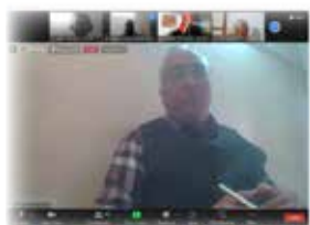
Webinar on Bharatiya Nyaya Sanhita (New law replacing Indian Penal Code)