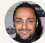
Mr. Rahul Bose