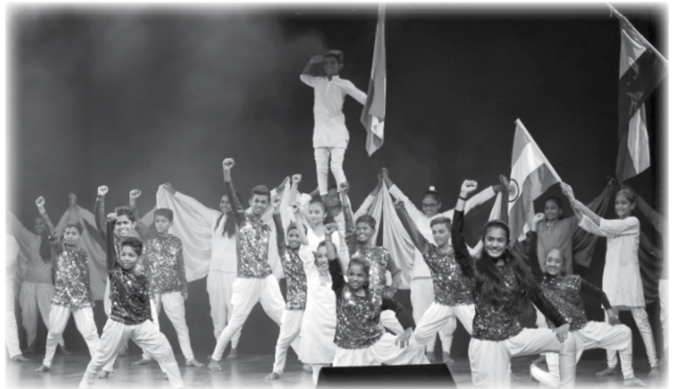
Performance by students of Sardar Vallabhkhai Patel Vividhalkshi Vidyalaya

“Together we march beyond 26/11 to a secure city” - a much awaited event of PCGT since 2009. Students of Sardar Vallabhkhai Patel Vividhalakshi Vidyalaya, Kandivali, put up a grand show at the Nehru Auditorium, Worli. The idea of getting the students involved was to teach them about Peace, Love, Unity, Harmony and creating a new story for our city and country. More than 500 School students and 35 Principals along with other guests attended the programme.