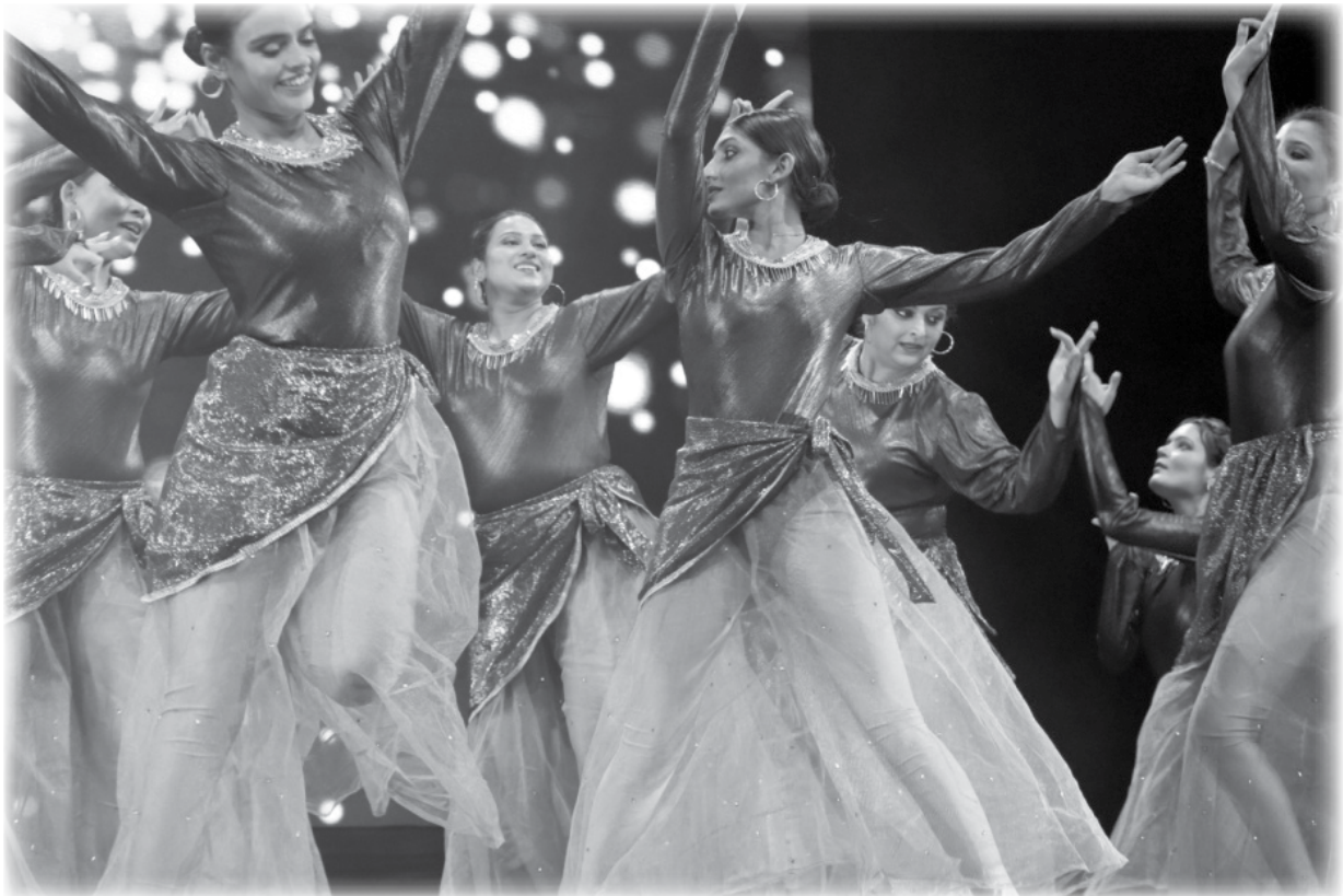
Bharat Soka Gakkai dancers