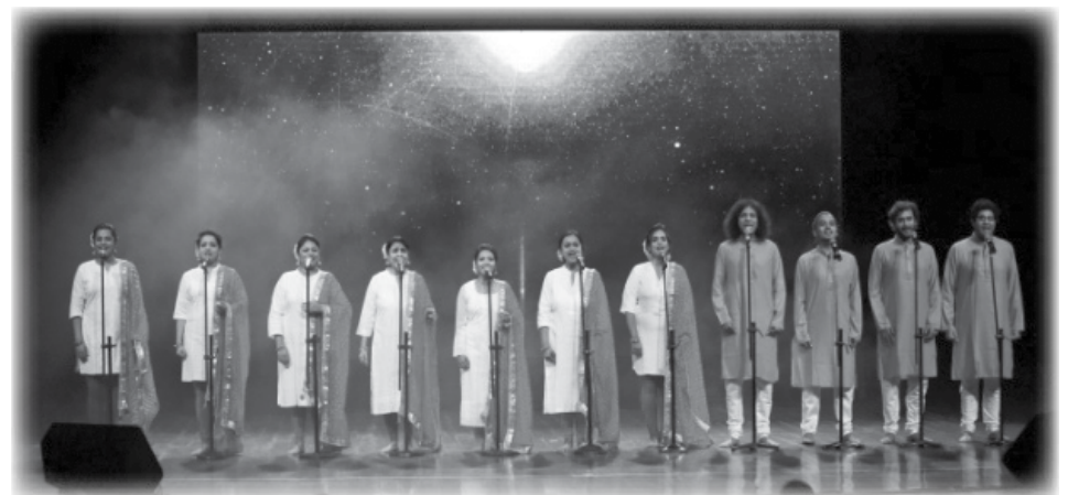
Bharat Soka Gakkai singers