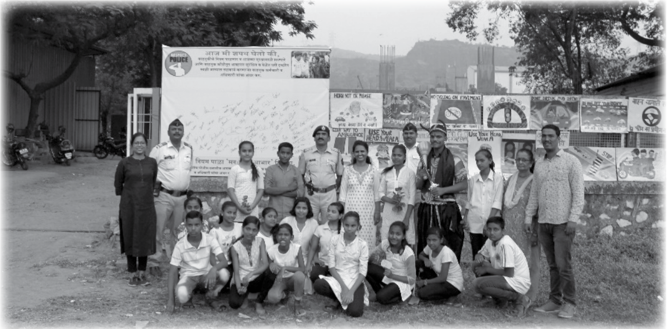
The volunteers of Traffic Awareness Campaign

Under the initiative Kuchh Aur, Traffic Awareness Campaign was conducted in the communities of Nerul, Jui Nagar and Seawood Darave, Navi Mumbai.