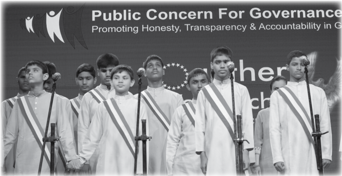
Children of Happy Home and School for the Blind singing a song