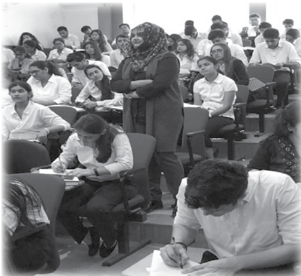
Question-Answer Session at University of Mumbai Law Academy, Fort

All the above sessions were very effective and students were asked to draft mock RTI applications.