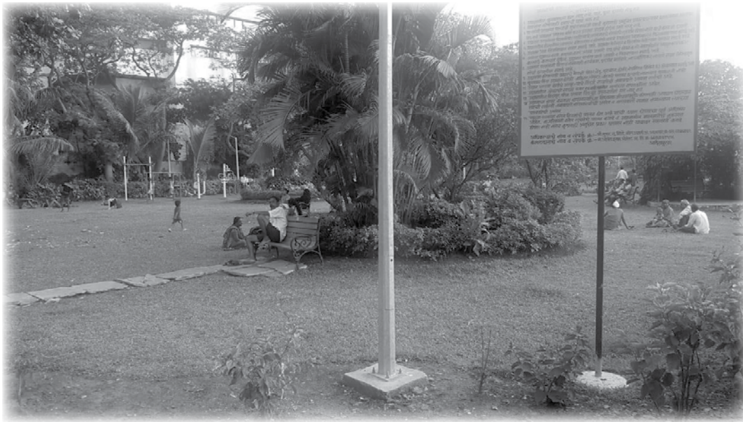
Vikas Udyan, Cuffe Parade, now open