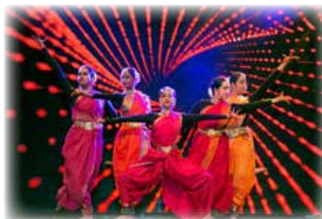
'Youth Wield Your Power' performed by 'Boundless'

This was followed by an energetic dance by a group of 5 young women known as 'Boundless'. The piece was titled 'Youth Wield Your Power'.