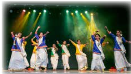
The 'Theythaka' dance by Anjuman Islam School

Anjuman Islam's - Dr. M.I.J Girls High School performed 'Theythaka' a popular dance form in Kerala that is often performed during the harvest festival of Onam.