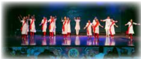
Invocation by Purshottam High School

The cultural part of the event started with an Invocation of 'Tera Mangal Hoyal' by students of Purshottam High School, followed by choir performances on 'Make God Your Guru' by Universal High School and 'People of the World' by Podar International School. Pragnya Bodhini High School students enacted a skit on 'Kaun Dekh Raha Hai!' to convey the message of self-correction and doing the right thing when no one is watching.