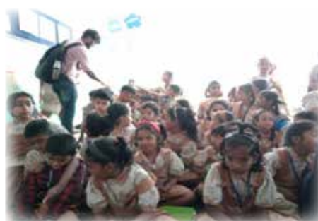
Intern serving food to school children