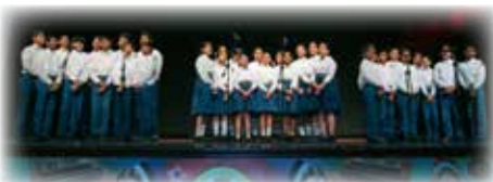
'People of the World' by Podar International School