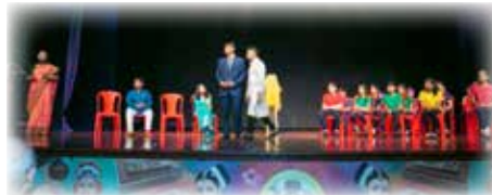
Skit by Pragnya Bodhini High School