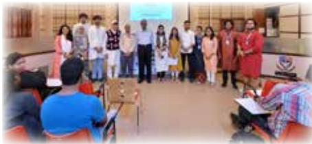
PCGT Trustees and staff with the organizing committee of St. Xavier's College

In this quarter, PCGT in their month-long internship had 19 LLB students from KES' Shri Jayantilal H. Patel Law College and 3 LLM students from Tata Institute of Social Sciences (TISS). The interns participated in several activities under the Youth For Governance vertical.