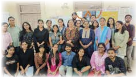
PCGT interns at the Office of Crime Against Women Unit at Lower Parel

PCGT's interns got an opportunity to visit the 'Crime Against Women' Unit at Lower Parel and Mumbai Traffic Police Head Quarters at Worli. They gained insight about the functioning of these offices and its related Acts.