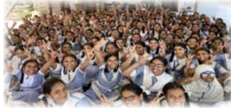
Post session on Time Management at Anjuman Islam Girls' High School

time management can help manage their goals and prioritize them in order to manage work, social life and sleep.