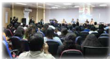
Panel Discussion on Social Implications of Same Sex Marriage in India