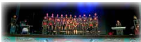
'Make God Your Guru' sung by Universal High School