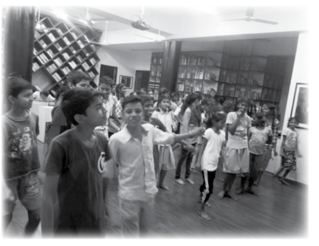
Students during Gender Equality Activity

a boy should do and the work a girl should do. The students were also requested to express their gratitude and appreciation for all the women in their life as we were focusing on